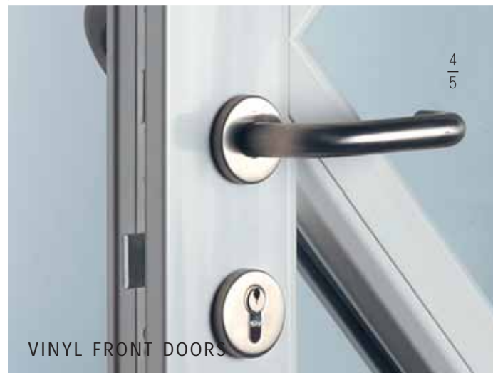
VINYL FRONT DOORS

Creative and inexpensive front doors for the special entrance. You can choose among: straightforward design models, timeless classics, or romantic, traditional doors. Whether made of vinyl, wood, or wood-aluminum—UNILUX front doors are the perfect combination of form and safety. Additionally, each model can be altered individually: custom height and width measurements accurate to the millimeter, variably shaped, size and position of the lighting panes, materials and colors, handles, applications. Go ahead and design your dream door together with your special UNILUX dealer. For an overview of models see next page.