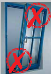
MALOPERATION SAFETY LOCK