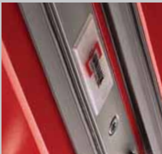
STURDY DOOR DESIGN