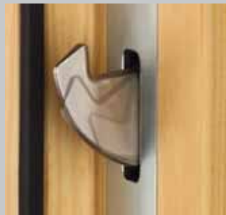
SWIVEL-HOOK SAFETY LATCH