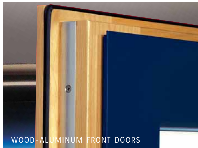
WOOD-ALUMINUM FRONT DOORS