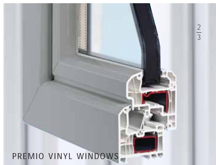
PREMIO VINYL WINDOWS