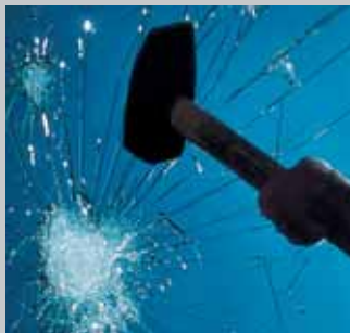
CERTIFIED SAFETY GLASS