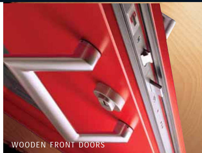
WOODEN FRONT DOORS